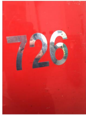
Photo of License Plate