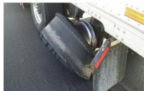
Photo of Tire/s After Work is Complete